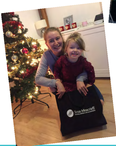
Left: One of the happy recipients of a gift bag