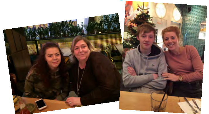
Staff and young people enjoying an evening at Nandos

When staff at Portland Street asked their young people where they would like to go for a staff/residents' meal in the run up to Christmas, the resounding answer was "Nandos"! It was duly arranged and all set off in high spirits. The meal was greatly enjoyed and the night was declared a huge success by everyone.