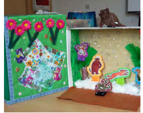
One of the book boxes we made to help us read interactively with our children.

It is such an exciting time being a Mum and this group is a safe space for our Mums to come together and share the highs and help each other through the lows. We learn about our children and give each other tips on good food, positive play activities and the best ways of helping our children grow up. Watch this space for the latest news on our latest projects.