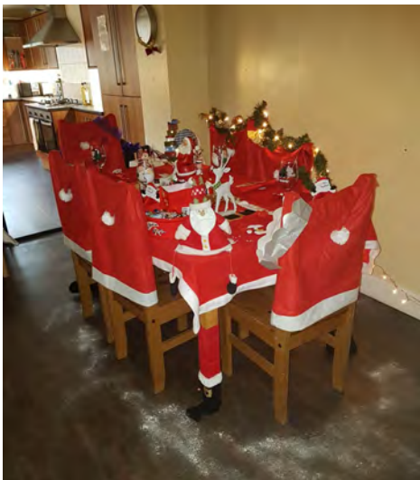
All set for Christmas Dinner at Cauvin House