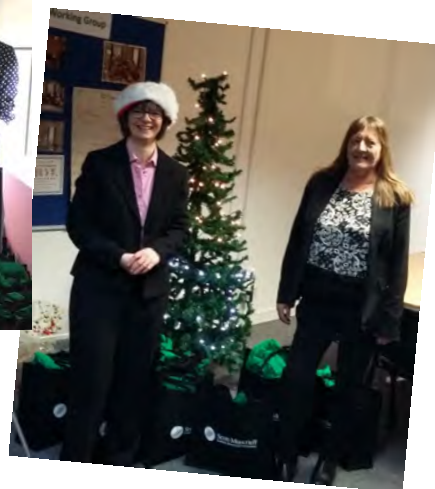
Top left: Staff at Scott-Moncrieff help to prepare the gift bags