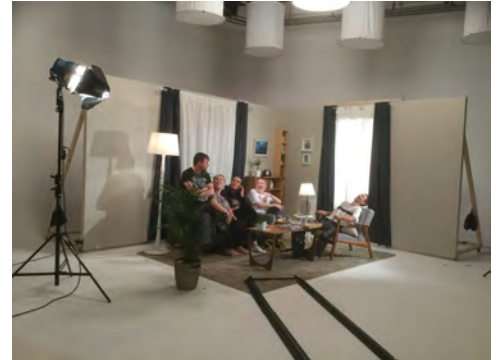
Our young people taking part in foster carer recruitment filming