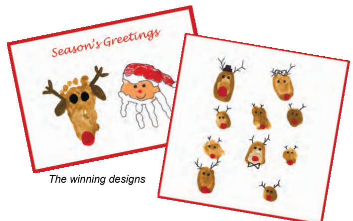
The winning designs

Well done to all who took part in the contest - all the entries were fantastic!